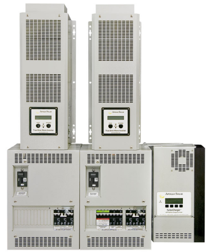
Parallel Stacking with T80HV